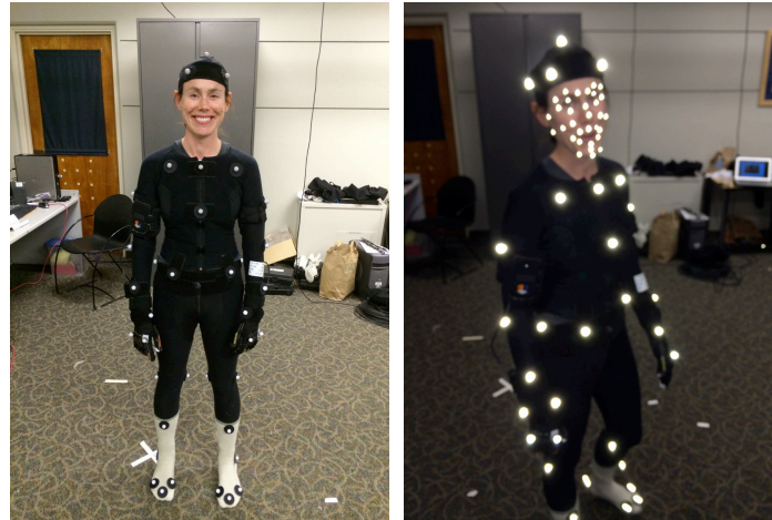
Figure 2. An actor performs the animated-GIF gesture library during a motion-capture session

of each gesture, allowing a viewer to quickly and accurately learn the form. An unexpected benefit is that animated-GIFs also capture other critical semiotic resources of the multimodal Gestalts (Mondada, 2014) that accompany gesturing such as patterns of gaze and facial expressions (Streeck, 2009).